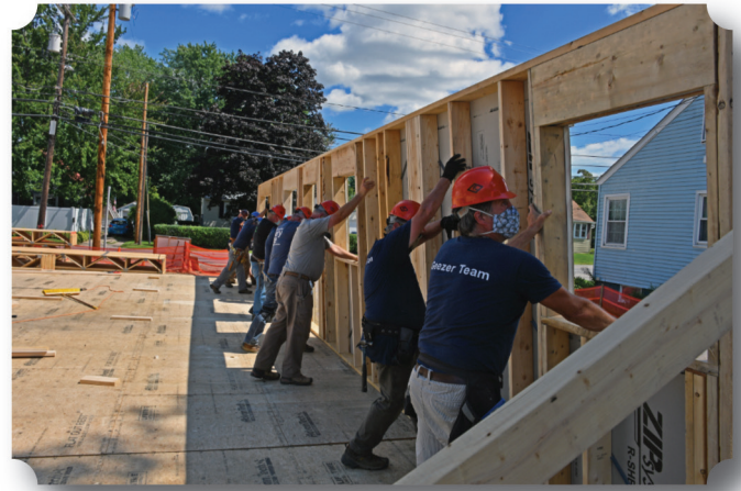
The first wall goes up for the Fourplex on Hinesburg Road in South Burlington!

Despite the delays caused by the COVID19 pandemic, our fabulous volunteers are back at work building homes for 5 local families! Thanks to your donations, we are building a Fourplex on Hinesburg Road in South Burlington and earlier this month we also began a single family home on Elmwood Avenue in Burlington.