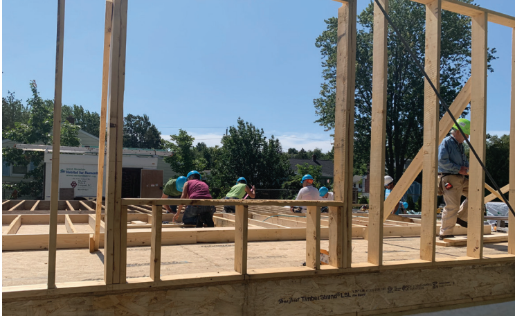
A duplex and a single family home are being built on North Avenue in Burlington.

We are fortunate to have two core construction teams who recently finished the homes in South Burlington and Burlington. One team then began to build a single family home and a duplex on North Avenue in Burlington and the second team recently started to build a duplex in Milton. They plan to “shell in” the homes so that they can continue to build inside during the winter. In order to increase the number of homes we build each year, we are looking for land so that we can almost immediately finish one build and move to the next. Your donation is an investment in strengthening our community with affordable housing for people who work.