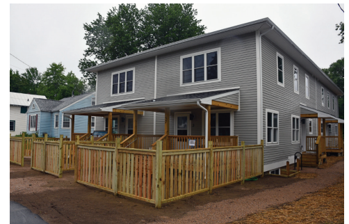
4Plex on Hinesburg Road in South Burlington.