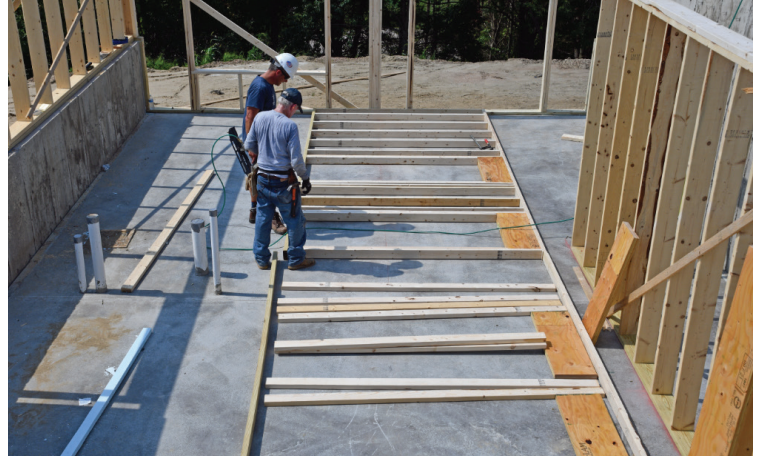
Duplex being built at Clearview Estates in Milton.